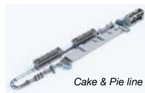
Cake & Pie line

On the first floor we will exhibit scale models from our pizza production line and our cake & pie production line (the biggest in the world). We will show a selection of complete fabricated consumer products.